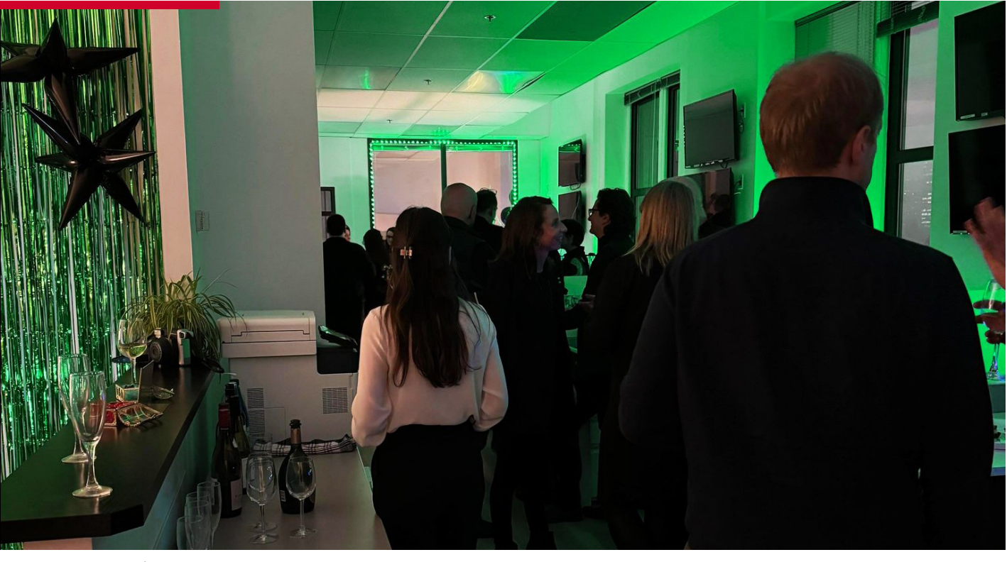
THEMA DAY- Matrix event 17th January – Montreal

CONTENT AMERICAS 23th-25th January - Miami